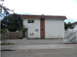
1530 NE 151st St Unit#102

MLS#: A10134902 Status: R Price: $1,350 SqFt: 1,085 Beds: 2 Bath: 1.1 (1 1)