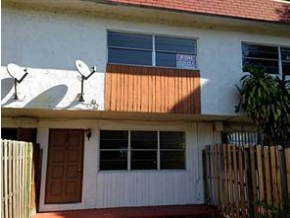
1560 NE 151 ST Unit#103

MLS#: A10088904 Status: R Price: $1,340 SqFt: 1,075 Beds: 2 Bath: 1.1 (1 1)